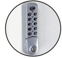
▲ Option Code lock (1 per door)