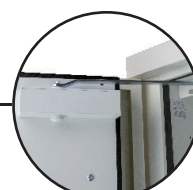
Self-closing door(s) with thermo-fuse